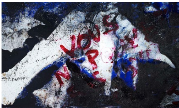
Philippe PASTOR, Les Oiseaux du Malheur REF: 14 069 LOM Mixed media on canvas 182 x 309 cm 2014