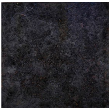
Philippe PASTOR, Bleu Monochrome REF: 14 072 BM Mixed media on canvas, natural pigment and elements 200 x 200 cm 2014