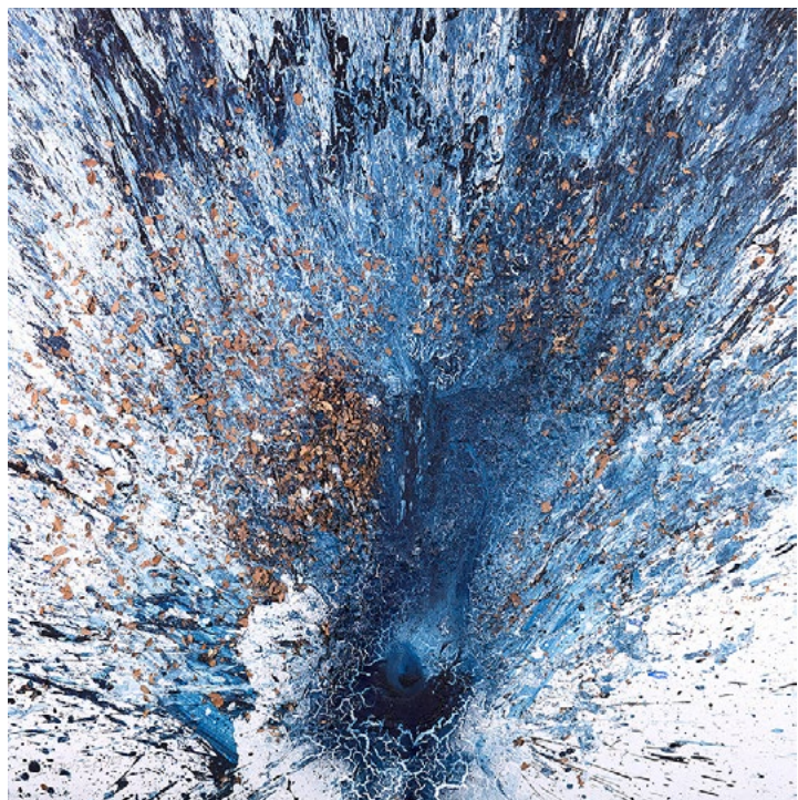
Philippe PASTOR, Explosion , mixed media on canvas, natural pigment and elements, 210x210cm, 2013 (Courtesy of the artist / Picture : François Fernandez)