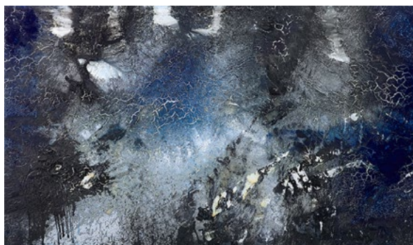
Philippe PASTOR, Avec le Temps REF: 14 082 ALT Mixed media on canvas 182 x 309 cm 2014