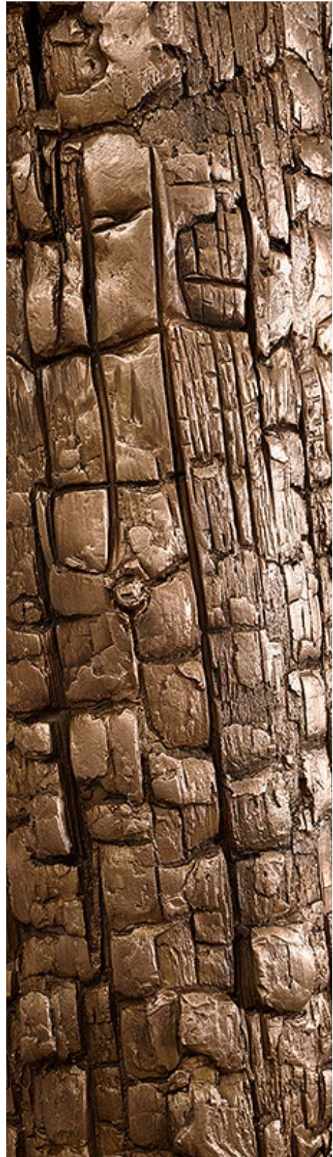
Philippe PASTOR, The Burned Trees , bronze, 2018

The fire, at the origin of dramatic forest destructions, is four times out of five provoked by the hand of Man, whose responsibility is denounced by the artist. This approach, which also can be found in the paintings presented, is more widely related to the particularly critical environmental and social context nowadays, in the era of the Anthropocene, global warming, looting of natural resources, invasive pollution and rising water levels.