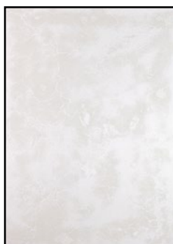
Philippe PASTOR, North Pole REF: 16 014 NP Mixed media on canvas 183 x 130 cm 2016