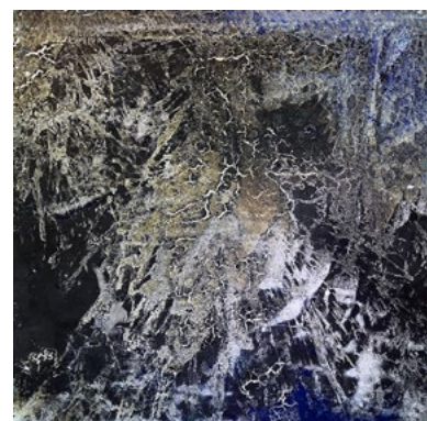
Philippe PASTOR, Avec le Temps REF: 14 055 ALT Mixed media on canvas 200 x 200 cm 2014