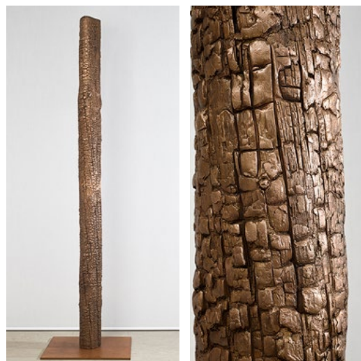
Philippe PASTOR, Les Arbres Brûlés Edition of 7 + 1AP Bronze 275 cm high 2018